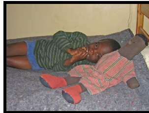
Orphan resting with one of our dolls which was "filled with love" by St. Paul's NoMIC kids.

Nyadire United Methodist Mission located in Zimbabwe contains a hospital, pre-school, primary and secondary schools, teachers' and nurses' training colleges, farm, Home of Hope Orphanage, and a United Methodist Church. In the winter temperatures fall below 40 degrees. We have made blankets and hats for the babies, children and adults on the mission. We have also made dolls, puppets, hacky-sack balls, and checker boards for the children in Home of Hope Orphanage located next to the hospital. For more information go to www.nyadire.org