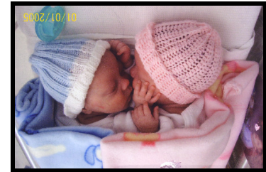
Preemies at Allegheny General Hospital

Project Linus is a national organization which began in 1995. Blankets are made to provide security to seriously ill or traumatized children. Our Project Linus blankets and preemie hats are given to the Pittsburgh Chapter coordinator who then distributes the blankets to hospitals, police departments, firefighters, etc. in the Pittsburgh area. You can learn more about Project Linus at www.projectlinus.org